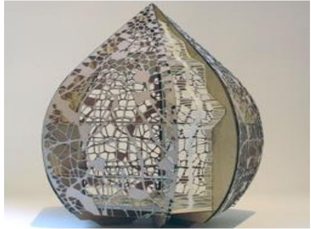
New Holland Folly: Studio 505