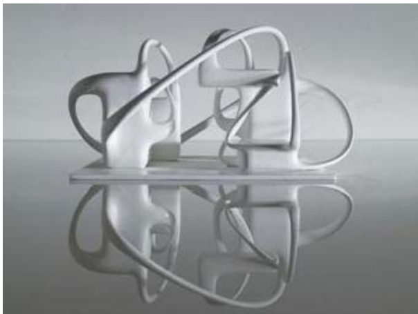
Medical School: Enter Architecture